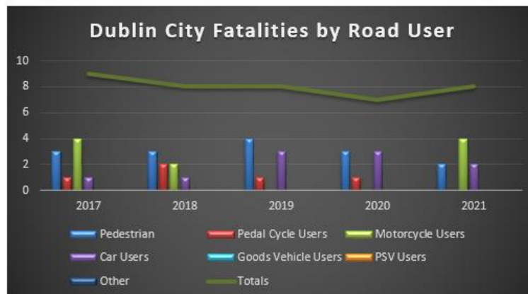
Graphic 1: Dublin City Fatalities by Road User

We are aware of 11 incidents within Dublin City Parks since August 2015. Given the millions of park visits over this time, this is a relatively small number of reported incidents. Anecdotally, however there is no doubt that with increased cycling and the sale of scooters the conflict between pedestrians and cyclists/scooters will become a greater problem. There is no legislation or regulation in relation to the sale or use of scooters or indeed scrambler bikes.